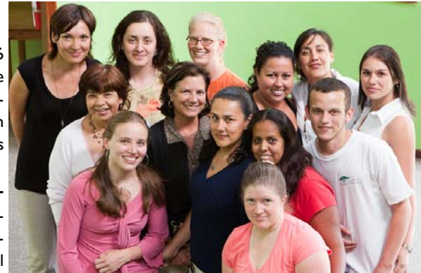
Some of MVI's Team